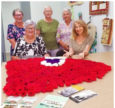
Greenwood Lifestyle Stitchers with the 228 poppies they knitted. Thank you ladies for your support.